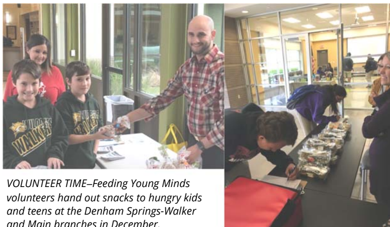
VOLUNTEER TIME—Feeding Young Minds volunteers hand out snacks to hungry kids and teens at the Denham Springs-Walker and Main branches in December.

Tuesday, January 2 from 4:00 – 5:00 p.m. Tuesday, January 16 from 4:00 – 5:00 p.m.